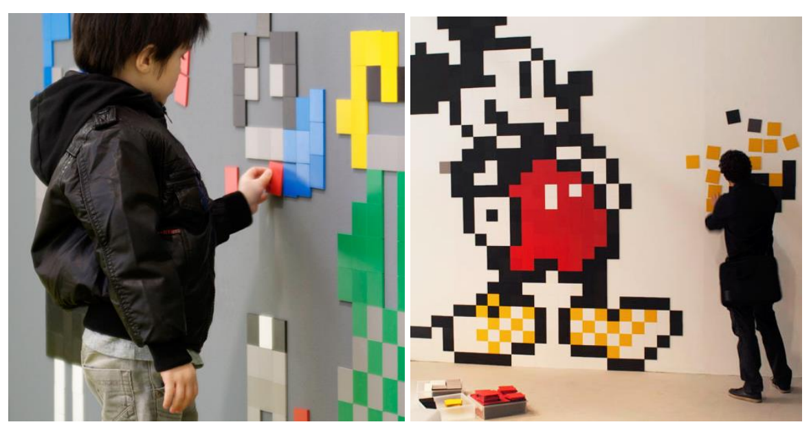
Furthermore parts of the walls can be integrated as well with educational games, so children may learn by playing